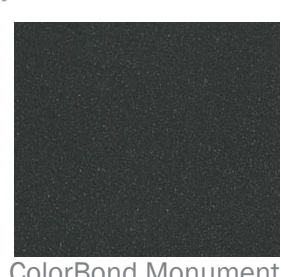
ColorBond Monument (Textura™)